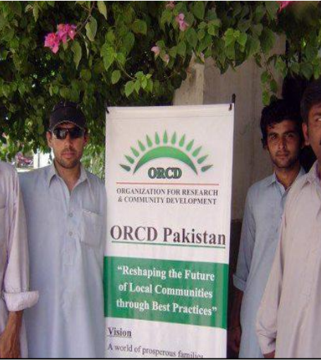
Team of ORCD Pakistan –a local sister setup of ORCD Afghanistan

We believe in the success of development projects, thus we have established partnerships at international and national level. At national level we got affiliated with governmental offices such as Ministry of Women Affairs, Ministry of Public Health, and at bottom level with community development councils (CDCs), and other important local stakeholders such as Aga Khan Foundation (AKF), Afghan Health Services (AHDS), GiZ-DETA, HNTPO, Solidarity for Afghan Families (SAF), Bakhtar Development Network (BDN) and continuously seeking out partners that effectively implement programs promoting human development and rights – through communities.