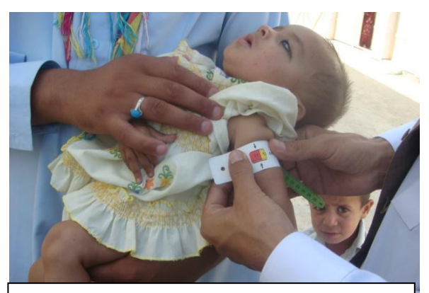
ORCD Surveyors during survey in Kandahar province

ORCD conducted a survey suing SMART methodology in Kandahar. We believe the experience ORCD got through conducting this survey could be replicated to other provinces including Baghlan in future.