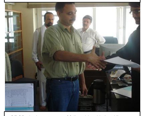
ORCD signing contract of fellowship with Aga Khan Foundation in Baghlan province