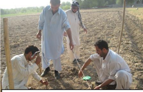
A demonstration on preparing land for optimized vegetable production

Farmers in Baghlan usually produce more or less similar crops and these crops unfortunately fail to give enough yield food shortage occurs. Diversification of agricultural production is deemed a desperate need of its inhabitants and is important because best practices in farming could maximize sources of