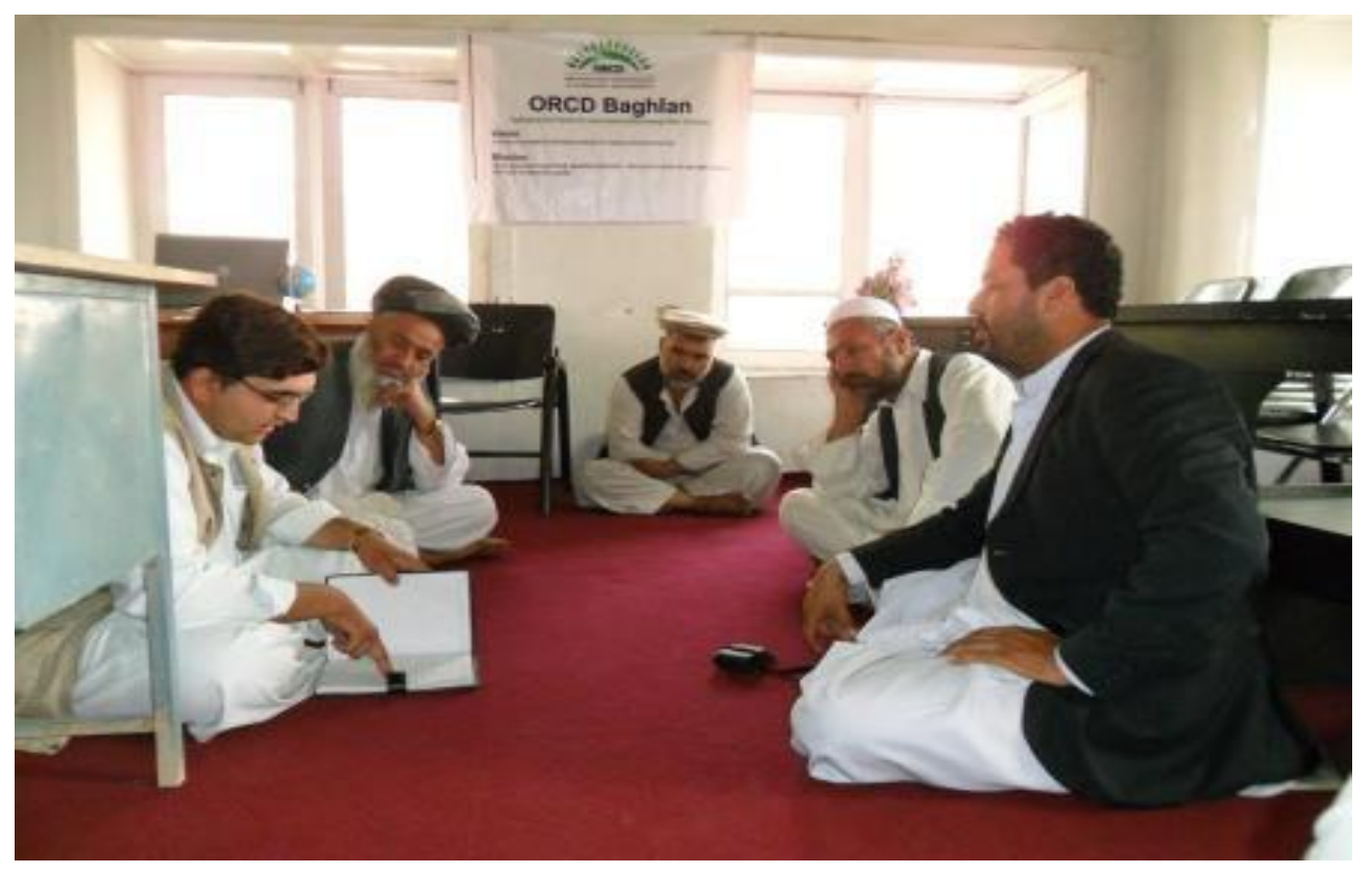
Elders of Baghlan e Markazi actively supported our vegetable production project after this meeting

Throughout the year 2012, ORCD worked with community health shuras in two districts of Baghlan, 3 districts of Daikundi and 2 districts of Kandahar where it implemented various projects.